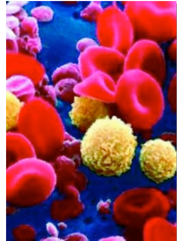
Adult stem cells in the bloodstream

For those of us just wanting to maintain optimal health or address the effects of aging, injury, or day to day wear and tear, a smaller but steady release of our existing stem cells into the bloodstream can produce considerable health benefits. When StemEnhance™ is used as a daily supplement over time, the stimulation of billions of additional stem cells in the bloodstream could be one of the safest and most efficient methods for maintaining optimal health that science has yet discovered.