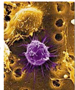
Adult stem cell in bone marrow

Adult stem cells are predominantly formed in the bone marrow. And, just as in the beginnings of life, adult stem cells can literally change into any type of cell in the body throughout life. These adult stem cells are released from the bone marrow into the circulation of the bloodstream to seek out problem areas, then renew and restore those areas.